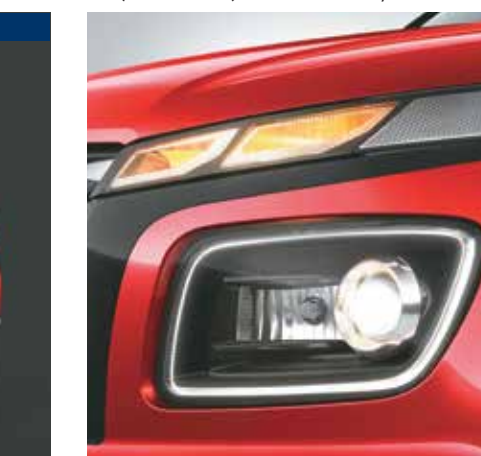
Puddle lamps LED projector headlamps

Other features: LED DRL & positioning lamps | Cornering lamps | Headlamp escort function | Chrome finish outside door handles | Roof rails